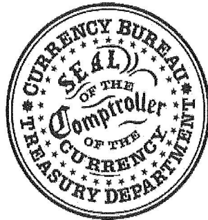
Acting Comptroller of the Currency